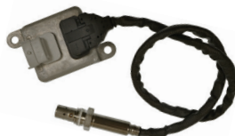
NOX014 - Upstream