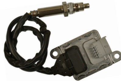
NOX012 - SCR Catalyst Outlet

Ram Trucks w/ 6 Cyl. 6.7L Engines (2018-13)