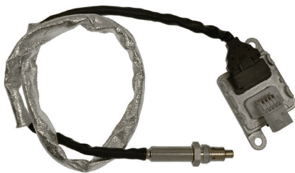
NOX011 - Upstream

Ram Trucks w/ 6 Cyl. 6.7L Engines (2018-13)