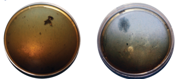
Dirty Oil Found in the Competition's Pumps