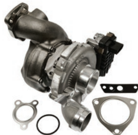
TBC547 - DIESEL Freightliner / Mercedes-Benz / Dodge Sprinter 3.0L (2009-07) VIO Over 61,000