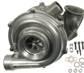
TBC524 - DIESEL Ford F- and E-Series 6.0L (2005-04) VIO Over 360,000