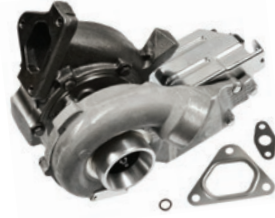
TBC546 - DIESEL Dodge / Freightliner Sprinter 2.7L (2006-04) VIO Over 45,000