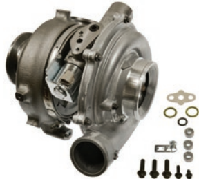
TBC523 - DIESEL Ford F- and E-Series 6.0L (2010-05) VIO Over 500,000