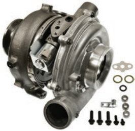
TBC522 - DIESEL Ford F-Series 6.0L (2004-03) VIO Over 286,000

Below are some of our top-selling Turbochargers, for both gasoline and diesel fuel systems. These units are only a sample of the 60+ high-quality, new No-Core Turbochargers available from Standard®.