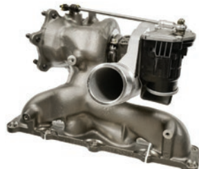
TBC598 - GAS Hyundai Santa Fe and Kia Sportage 2.0L (2016-11) VIO Over 300,000