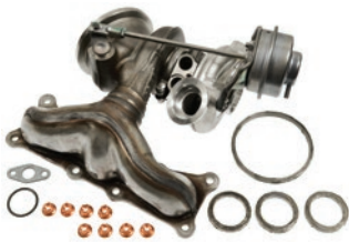
TBC536 - GAS BMW 3.0L (2016-08) VIO Over 68,000