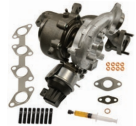
TBC529 - DIESEL VW / Audi 2.0L (2014-09) VIO Over 150,000