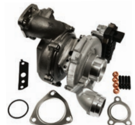
TBC602 - DIESEL Freightliner / Mercedes-Benz Sprinter 3.0L (2017-10) VIO Over 189,000