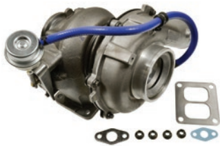
TBC591 - DIESEL International 7.6L (2004-1999) VIO Over 98,000