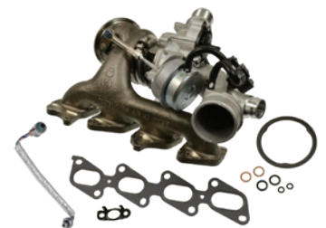
TBC583 - GAS Chevrolet Cruze and Sonic 1.4L (2018-11) VIO Over 1.8 million