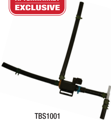
TBS1001 Ford (2019-10) VIO Over 5.7 Million