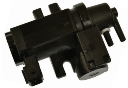
TBS1004 BMW (2016-10) VIO Over 917,000