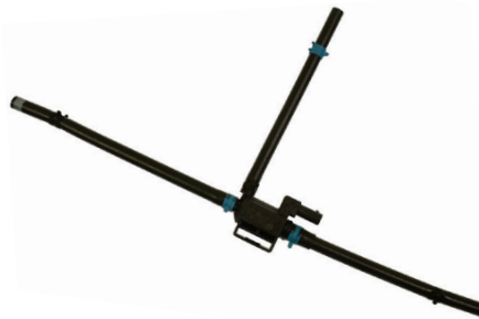
TBS1003 Ford (2019-13) VIO Over 1 Million