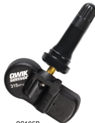
QS105R Universal VIO Over 109 Million