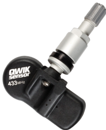
QS104M Universal VIO Over 15.4 Million

For today's advanced TPMS systems, it's more crucial than ever to choose premium replacements like our new Universal Programmable QWIK-SENSOR™ TPMS Sensors: QS104 for 433 MHz systems and QS105 for 314.9/315 MHz systems. Both sensors are NSF® Registered to ensure proper function on complex Auto-Relearn vehicles with complex TPMS technology such as LOCSYNC, PAL, POD, and WAL.