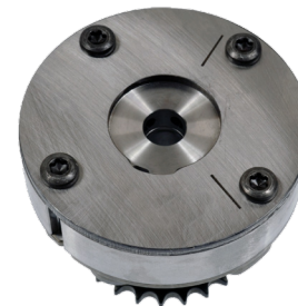
VT551 Ford cars, trucks, SUVs & vans (2016-11) Lincoln luxury vehicles (2016-11) VIO Over 3.5 Million