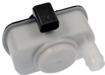
LDP14 Chrysler/Dodge/Ram cars, trucks, SUVs & vans (2017-06) Jeep Compass/Patriot/Wrangler (2016-07) VIO Over 7.7 Million