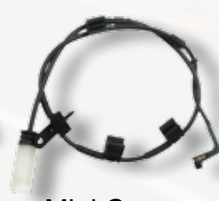
Mini Cooper PWS184