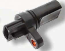
Nissan Camshaft Sensor PC464