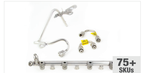
GDI High- & Low-Pressure Fuel Feed Lines