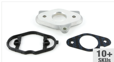
GDI O-Rings, Gaskets, and Plates