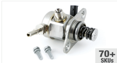
GDI High-Pressure Fuel Pumps