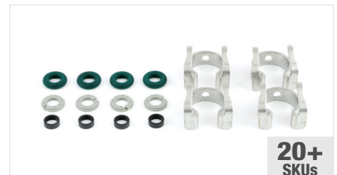
GDI Injector Seal and Service Kits