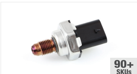
GDI Fuel Pressure Sensors