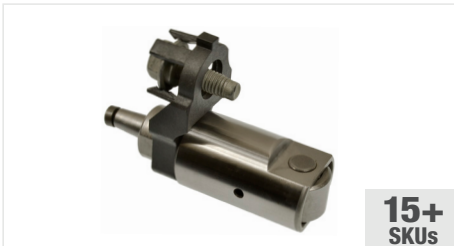
GDI Camshaft Followers

The best GDI injector can't perform as designed with restricted fuel lines or worn gaskets. Standard's GDI Program offers technicians everything they need for a complete GDI fuel system service.