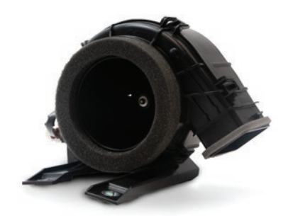
Four Seasons® 76808 Battery Cooling Fan Motor Toyota Prius (2019-16)

For more than 100 years, when the OE failed, technicians have trusted Standard®, Blue Streak® and Four Seasons® to deliver a part that's equal to or better than the original it's replacing.