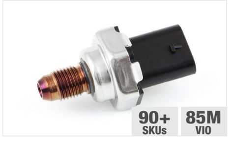
Fuel Pressure Sensors