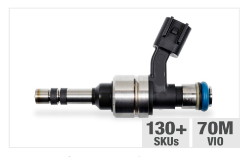
GDI Fuel Injectors