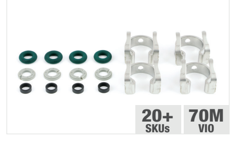
GDI Injector Seal and Service Kits

Optimal fuel injection performance takes quality components, expert manufacturing and extensive testing. And that's precisely what Standard® delivers.