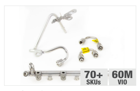
GDI High- & Low-Pressure Fuel Feed Lines