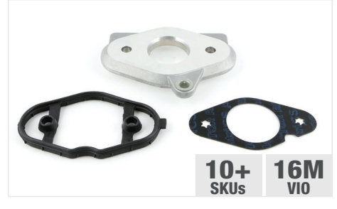
GDI O-rings, Gaskets, and Plates