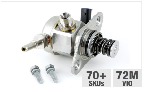
GDI High-Pressure Fuel Pumps