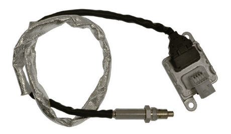
NOX011 - Upstream Ram Trucks w/ 6 Cyl. 6.7L Engines (2018-13)