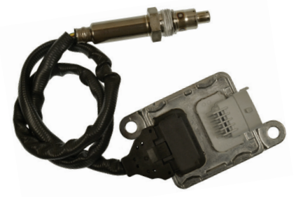
NOX012 - SCR Catalyst Outlet Ram Trucks w/ 6 Cyl. 6.7L Engines (2017-14)