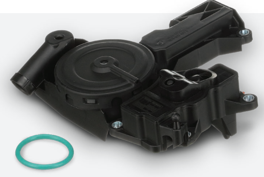
Engine Oil Separator

Engine Oil Separators keep oil from recirculating into the cylinders, coating the intake with oil and blocking airflow. This can lead to reduced engine performance and reliability.