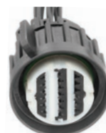
S3062 Transmission Bulkhead Connector (2019-2011)