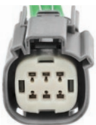
S3056 Nitrogen Oxide Sensor Module, Taillight Connector (2022-2013)