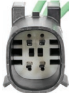
S3000 Oxygen Sensor Connector (2020-2011)