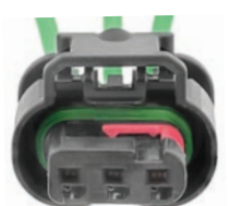
S3055 Water Pump, License Plate Light, Park Assist Sensor Connector (2023-2013)