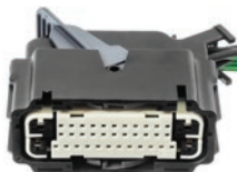
S3041 ABS Control Module Connector (2019-2011)