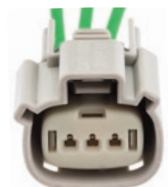
S3063 Daytime Running Lamp, Ignition Coil, Intake Manifold Runner Control Sensor, Water In Fuel Sensor Connector (2022-2010)

For more specific application data, visit StandardBrand.com