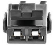
S3007 Power Seat Lumbar Motor Connector (2023-2000)