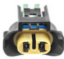
S3003 Fog Lamp Socket (2022-2017)