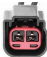
S3043 Engine Coolant Fan Motor, Power Window Motor Connector (2014-1999)