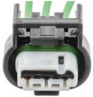
S2807 Cam/Crankshaft Sensor, EGR Pressure Feedback Sensor Connector (2021-2018)