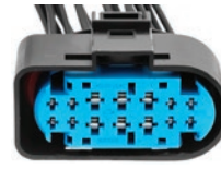
S3005 Headlight Wiring Harness Connector (2019-2012)