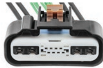
S3017 Windshield Wiper Motor Connector (2023-2002)