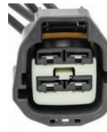
S3023 Cooling Fan Motor Connector (2022-2010)