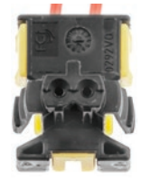
S3032 Air Bag, Seat Belt Pretensioner Connector (2023-2009)