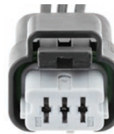
S3054 Turbocharger Wastegate Actuator Connector (2018-2015)