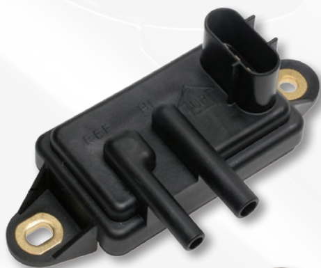
DPFE Sensor VP8

To prevent a recurrence of the P0401 code, Standard® recommends inspecting and replacing if necessary, the EVR and DPFE hoses when replacing the DPFE sensor. To further guard against a P0401 code, a de-carbonization treatment of the EGR system should be performed.