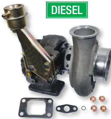
TBC545 Dodge Ram 2500 (1998-96) Dodge Ram 3500 (1998-96)