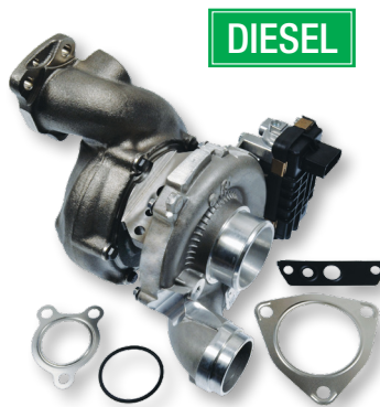
TBC547 Jeep Grand Cherokee (2009-07) Mercedes-Benz 3.0L CDI (2013-07)