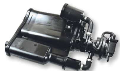
CP3422 Volkswagen CC (2015-09) Volkswagen Passat (2010-06) Volkswagen Tiguan (2015-09) VIO Over 500,000