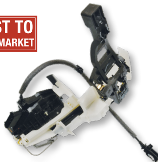
DLA889 Ford Focus (2015-12) VIO Over 1 Million