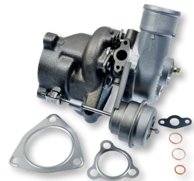
TBC582 Audi A4 (1999-97) Audi A4 Quattro (2000-97) Volkswagen Passat (1999-98)