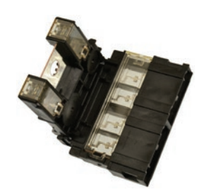
FH45 Nissan (2018-08) VIO Over 810,000