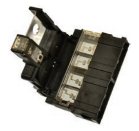
FH44 Nissan (2018-13) VIO Over 910,000

ABS plastic construction provides extra durability