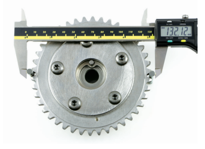
Sprocket Over Pin Diameter comparison