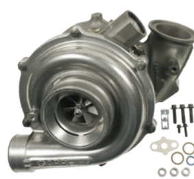
TBC524 - DIESEL Ford F- and E-Series 6.0L (2005-04) VIO Over 360,000