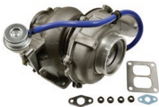
TBC591 - DIESEL International 7.6L (2004-1999) VIO Over 98,000