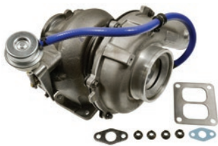
TBC591 - DIESEL International 7.6L (2004-1999) VIO Over 98,000