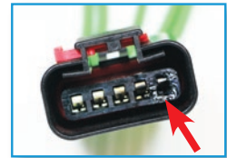
Burnt OE connector

Due to technological advancements on today's automotive heating and cooling systems, blower motor resistors have high amounts of current running through their connectors. As a result, the current produces heat that can melt the connector and resistor. Worn OE blower motors can create a demand for current that also damages the resistor or module. The excess current melts the wiring and plastic shroud, damaging the interface pins on the controller's circuit board.