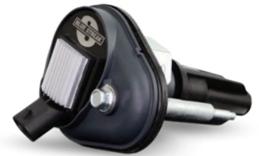
UF303 GM (2008-02)

To see what goes into our ignition coil testing, take a look at this competitor comparison between our UF303 and the OE: