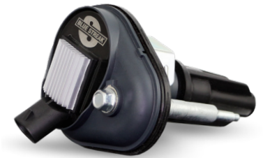
UF303 GM (2008-02)

To see what goes into our ignition coil testing, take a look at this competitor comparison between our UF303 and the OE: