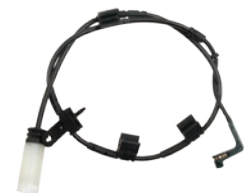
Mini Cooper PWS184