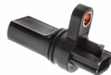
Nissan Camshaft Sensor PC464