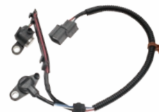
Honda Crankshaft Sensor PC133