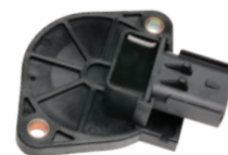
Chrysler Camshaft Sensor PC475