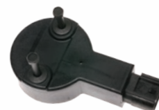
Ford Camshaft Sensor PC321