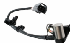
Toyota Crankshaft Sensor PC78