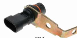
GM Crankshaft Sensor PC123