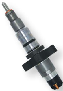
FJ932 Dodge Pickups (2004-03)