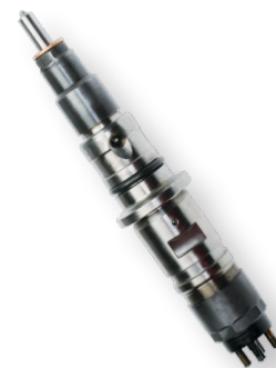
FJ1010 Dodge Pickups (2010-07)