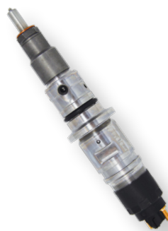
FJ1009 Dodge Pickups (2010-08)