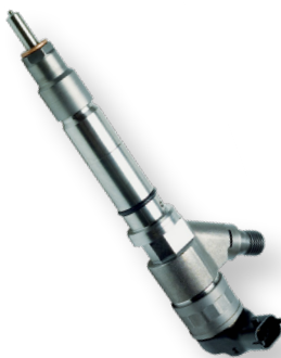
FJ962 GM Pickups, Fullsize Vans (2007-06)