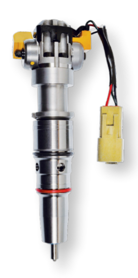
FJ1239 International Trucks (2005-04)