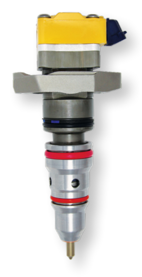
FJ926 Ford F Pickup, E-Vans (2003-99) International Trucks (2002-99)