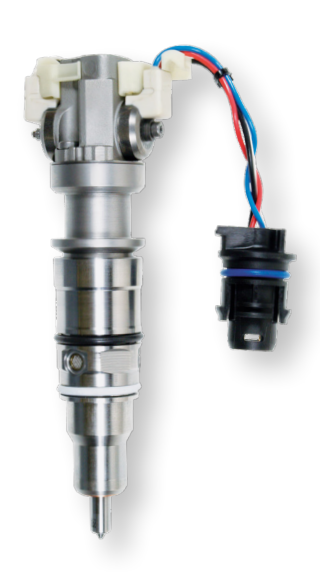
FJ927 Ford F Pickup (2004-03) International Trucks (2003-02)