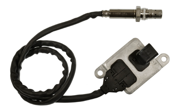
NOX002 - Upstream Chevrolet & GMC Trucks w/ 8 Cyl. 6.6L Engines (2014-10)