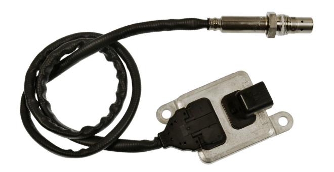
NOX001 - Downstream Chevrolet & GMC Trucks w/ 8 Cyl. 6.6L Engines (2014-10)